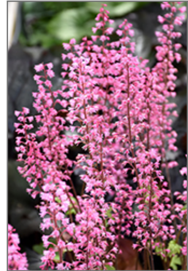
Dayglow Pink Foamy Bells flowers

Dayglow Pink Foamy Bells is a fine choice for the garden, but it is also a good selection for planting in outdoor pots and containers. It is often used as a 'filler' in the 'spiller-thriller-filler' container combination, providing a mass of flowers and foliage against which the larger thriller plants stand out. Note that when growing plants in outdoor containers and baskets, they may require more frequent waterings than they would in the yard or garden. Be aware that in our climate, most plants cannot be expected to survive the winter if left in containers outdoors, and this plant is no exception. Contact our experts for more information on how to protect it over the winter months.