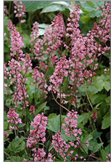
Dayglow Pink Foamy Bells flowers

This is a relatively low maintenance plant, and is best cleaned up in early spring before it resumes active growth for the season. It is a good choice for attracting hummingbirds to your yard. It has no significant negative characteristics.