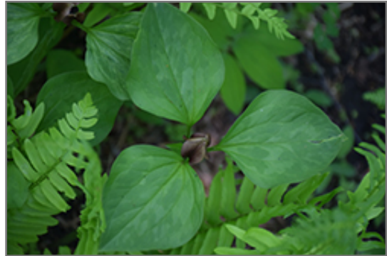
Toadshade flowers