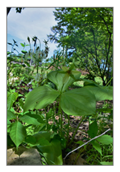
White Trillium in bloom

A beautiful eastern native perennial, presenting whorls of medium green leaves, appearing in triads; creamy white flowers also appear as a triad of petals; an outstanding woodland plant in a shady garden or border