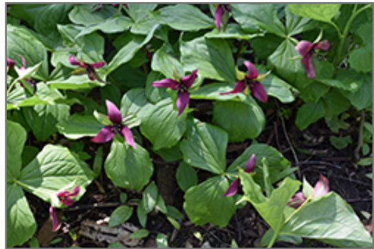
Red Trillium flowers

Other Names: Red Wakerobin, Purple Wakerobin