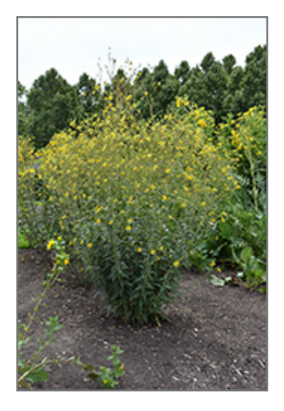
Whorled Rosinweed in bloom