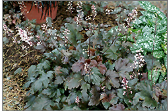
Chocolate Lace Foamy Bells in bloom