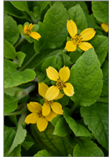
Green And Gold flowers

This perennial groundcover will spread by rhizomes, and can reach many feet in a few years; foliage is chartreuse-green and shiny, with cheery yellow star flowers appearing from spring to fall; a vigorous groundcover