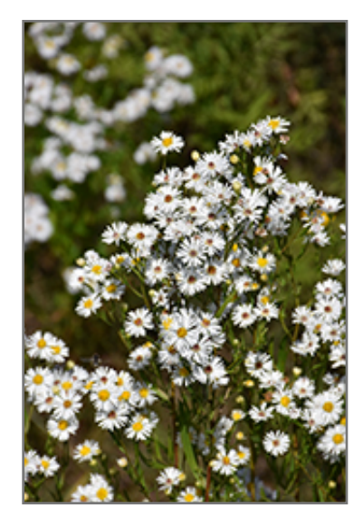
Heath Aster flowers

Heath Aster is recommended for the following landscape applications;