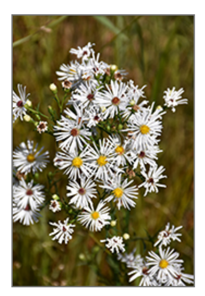
Heath Aster flowers

This plant does best in full sun to partial shade. It is very adaptable to both dry and moist locations, and should do just fine under typical garden conditions. This plant does not require much in the way of fertilizing once established. It is not particular as to soil type or pH. It is somewhat tolerant of urban pollution. This species is native to parts of North America. It can be propagated by cuttings.