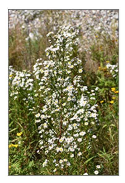
Heath Aster flowers