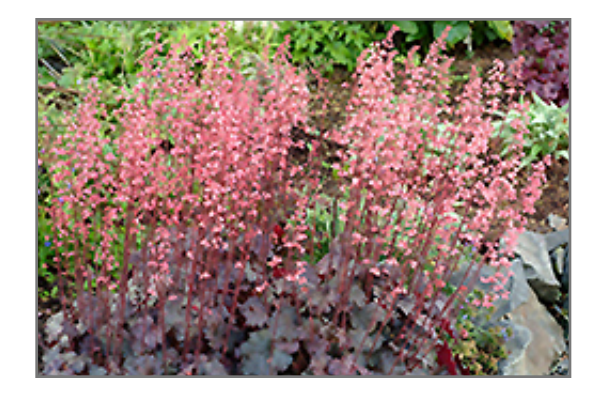
Vesuvius Coral Bells flowers