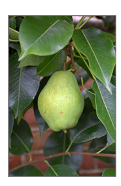
Kieffer Pear fruit

This is a dense deciduous tree with a more or less rounded form. Its average texture blends into the landscape, but can be balanced by one or two finer or coarser trees or shrubs for an effective composition. This is a high maintenance plant that will require regular care and upkeep, and is best pruned in late winter once the threat of extreme cold has passed. Gardeners should be aware of the following characteristic(s) that may warrant special consideration;