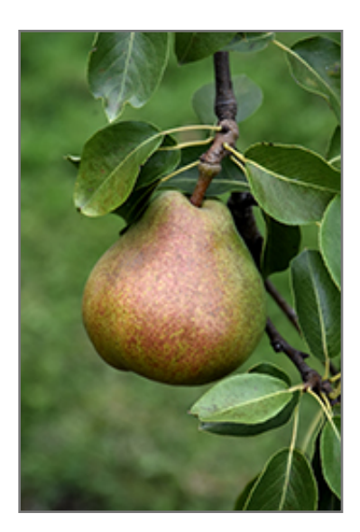
Comice Pear fruit

Comice Pear is covered in stunning clusters of white flowers along the branches in mid spring. It has forest green deciduous foliage. The glossy pointy leaves turn outstanding shades of yellow and red in the fall. The fruits are showy chartreuse pears with a red blush, which are carried in abundance in early fall. The fruit can be messy if allowed to drop on the lawn or walkways, and may require occasional clean-up.