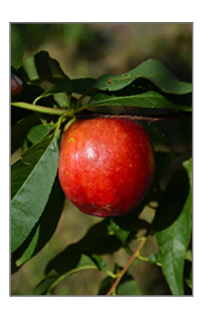
Suncoast Nectarine fruit

Suncoast Nectarine is draped in stunning clusters of fragrant shell pink flowers with red eyes along the branches from late winter to early spring, which emerge from distinctive rose flower buds before the leaves. It has dark green deciduous foliage. The narrow leaves turn yellow in fall. The fruits are showy buttery yellow drupes with a cherry red blush, which are carried in abundance from late spring to early summer. The fruit can be messy if allowed to drop on the lawn or walkways, and may require occasional clean-up.