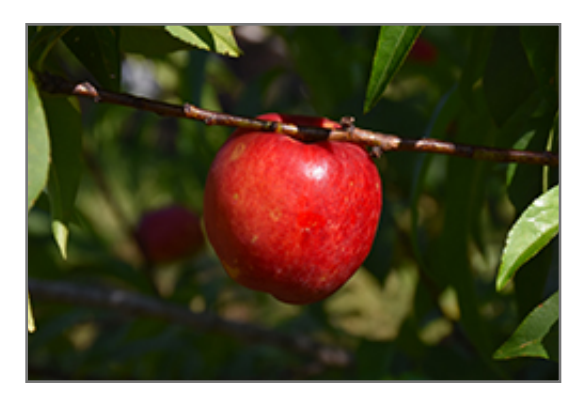
Sunbest Nectarine fruit

This is a deciduous tree with an upright spreading habit of growth. Its average texture blends into the landscape, but can be balanced by one or two finer or coarser trees or shrubs for an effective composition. This is a high maintenance plant that will require regular care and upkeep, and is best pruned in late winter once the threat of extreme cold has passed. Gardeners should be aware of the following characteristic(s) that may warrant special consideration;