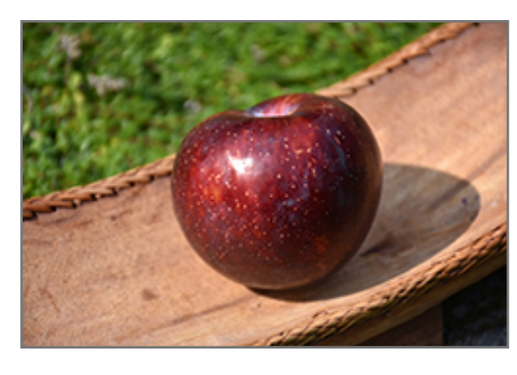
Geo Pride Pluot fruit

An inter-species, plum-apricot hybrid with showy fragrant white flowers in spring and sweet, dark red fruit with gold flesh in mid-summer; great for eating fresh and preserves; semi-clinging stone; must have a Japanese plum variety or hybrid as pollinator