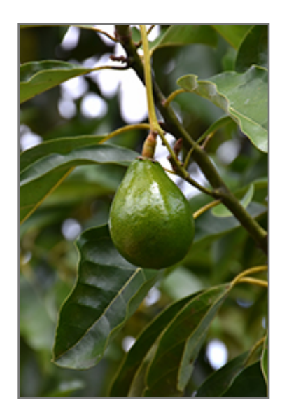
Lila Avocado fruit

Lila Avocado has attractive dark green evergreen foliage which emerges coppery-bronze in spring on a tree with an upright spreading habit of growth. The glossy oval compound leaves are highly ornamental and remain dark green throughout the winter. It features subtle clusters of fragrant white star-shaped flowers with chartreuse overtones at the ends of the branches from late winter to early spring. The fruits are showy dark green drupes which fade to black over time, which are displayed in mid summer. The fruit can be messy if allowed to drop on the lawn or walkways, and may require occasional clean-up. The rough brown bark adds an interesting dimension to the landscape.