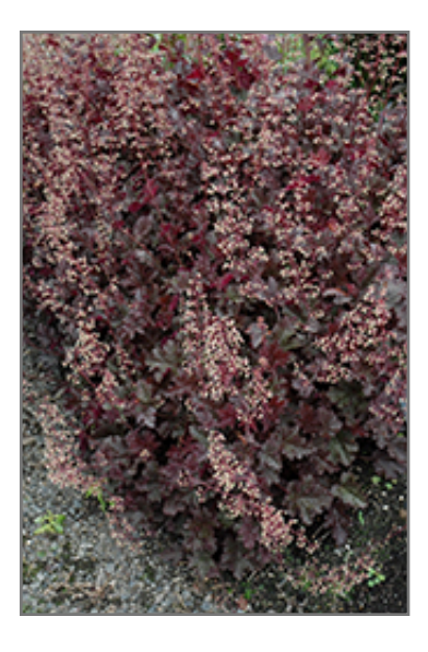
Purple Petticoats Coral Bells in bloom

This is a relatively low maintenance plant, and should be cut back in late fall in preparation for winter. It is a good choice for attracting hummingbirds to your yard. It has no significant negative characteristics.