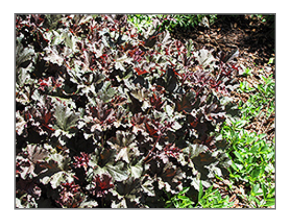
Purple Petticoats Coral Bells

Purple Petticoats Coral Bells is recommended for the following landscape applications;