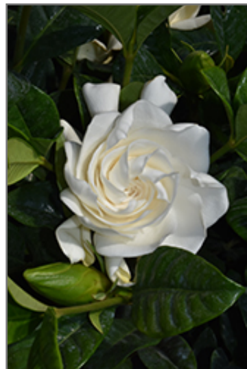
Aimee Gardenia flowers

When grown indoors, Aimee Gardenia can be expected to grow to be about 3 feet tall at maturity, with a spread of 24 inches. It grows at a slow rate, and under ideal conditions can be expected to live for approximately 30 years. This houseplant will do well in a location that gets either direct or indirect sunlight, although it will usually require a more brightly-lit environment than what artificial indoor lighting alone can provide. It does best in average to evenly moist soil, but will not tolerate standing water. The surface of the soil shouldn't be allowed to dry out completely, and so you should expect to water this plant once and possibly even twice each week. Be aware that your particular watering schedule may vary depending on its location in the room, the pot size, plant size and other conditions; if in doubt, ask one of our experts in the store for advice. It will benefit from a regular feeding with a general-purpose fertilizer with every second or third watering. It is very fussy about its soil conditions and must be grown in rich, acidic soil to ensure success. Contact the store for specific recommendations on pre-mixed potting soil for this plant.