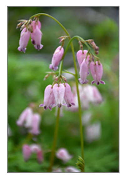
Pacific Bleeding Heart flowers

Lacy gray-green foliage on a compact mound with delicate, pink and lavender dangling heart-shaped flowers on nodding stems, like little jewels in the garden; likes moist, shady areas; will self seed and spread; good for beds, borders and cottage gardens