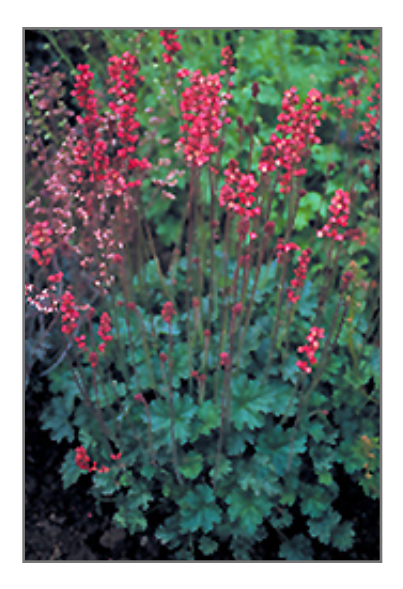
Magic Wand Coral Bells in bloom