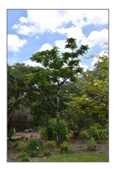
Japanese Prickly Ash