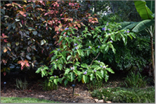
Potato Tree in bloom