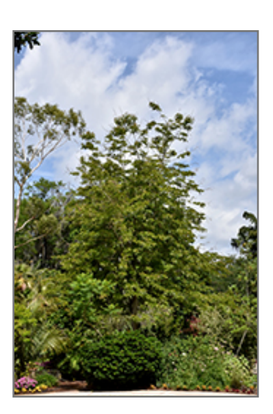
Siamese Senna