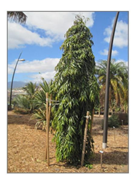
Columnar Mast Tree

This tropical plant does best in full sun to partial shade. It prefers to grow in average to moist conditions, and shouldn't be allowed to dry out. This plant should not require much in the way of fertilizing once established, although it may appreciate a shot of general-purpose fertilizer from time to time early in the growing season. It is particular about its soil conditions, with a strong preference for sandy, acidic soils, and is able to handle environmental salt. It is highly tolerant of urban pollution and will even thrive in inner city environments. This is a selected variety of a species not originally from North America.