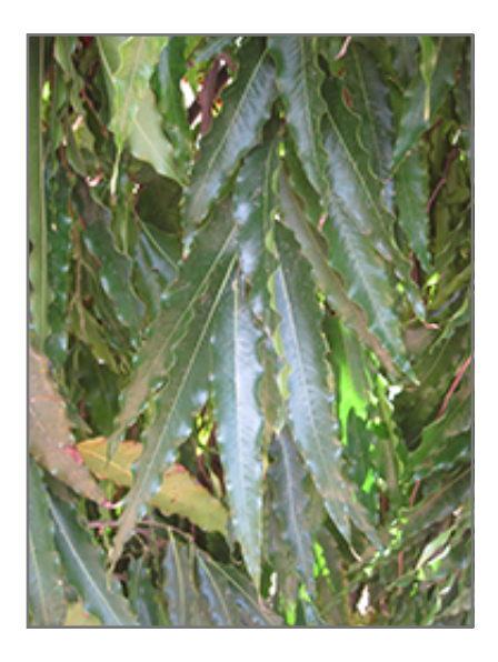
Columnar Mast Tree foliage