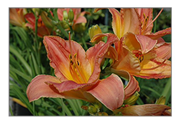
Sirocco Daylily flowers