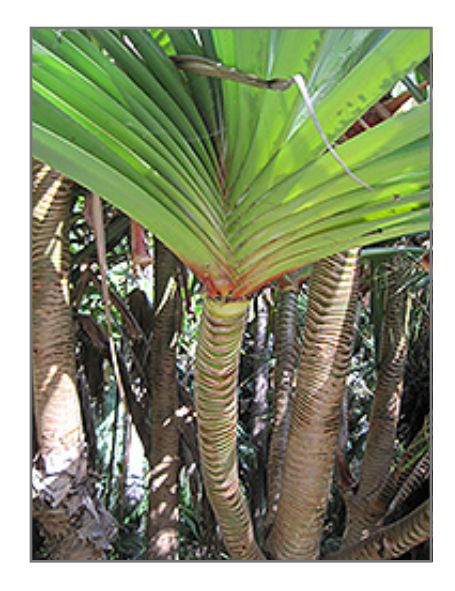
Common Screw Pine bark