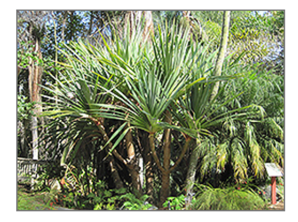
Common Screw Pine

This plant is native to the tropics and prefers growing in moist environments with evenly warm conditions all year round. In our climate, it is usually grown as an outdoor annual in the garden or in a container. If you want it to survive the winter, it can be brought in to the house and provided with special care, and then returned to the garden the following season. In its preferred tropical habitat, as a tree it can grow to be around 60 feet tall at maturity, with a spread of 30 feet. However, when grown as an annual or when overwintered indoors, it can be expected to perform quite differently, and its exact height and spread will depend on many factors; you may wish to consult with our experts as to how it might perform in your specific application and growing conditions.