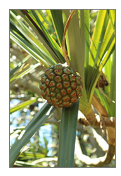
Common Screw Pine fruit

Common Screw Pine is a fine choice for the yard, but it is also a good selection for planting in outdoor pots and containers. Its large size and upright habit of growth lend it for use as a solitary accent, or in a composition surrounded by smaller plants around the base and those that spill over the edges. It is even sizeable enough that it can be grown alone in a suitable container. Note that when grown in a container, it may not perform exactly as indicated on the tag - this is to be expected. Also note that when growing plants in outdoor containers and baskets, they may require more frequent waterings than they would in the yard or garden. Be aware that in our climate, most plants cannot be expected to survive the winter if left in containers outdoors, and this plant is no exception. Contact our experts for more information on how to protect it over the winter months.