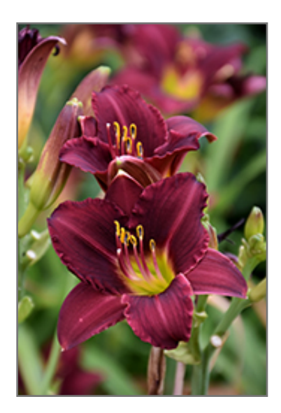
Ruby Stella Daylily flowers