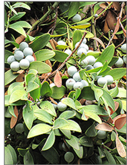
Asian Barberry fruit

Asian Barberry is recommended for the following landscape applications;