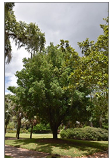
Asian Barberry