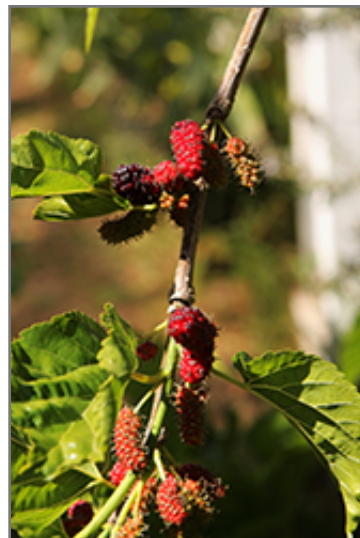
Black Mulberry fruit

Black Mulberry has dark green deciduous foliage on a tree with a round habit of growth. The serrated heart-shaped leaves turn outstanding shades of yellow and in the fall. The red fruits with a deep purple blush and which fade to black over time are held in abundance in spectacular clusters from mid summer to early fall. The fruit can be messy if allowed to drop on the lawn or walkways, and may require occasional clean-up.