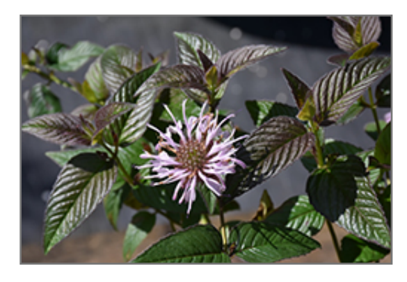
Midnight Oil Eastern Beebalm flowers