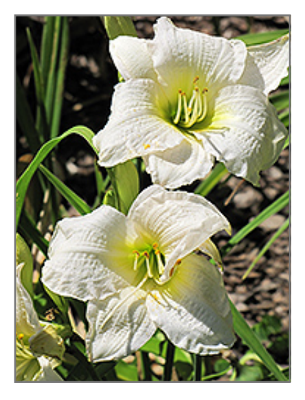
Gentle Shepherd Daylily flowers

Drought tolerant once established, this selection features lightly ruffled off white flowers with chartreuse colored throats; strong, sturdy stems rise above mounds of green arching foliage; a beautiful addition to perennial borders, beds and containers