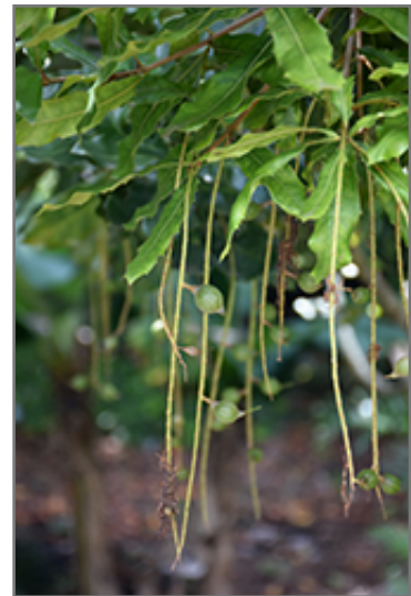
Beaumont Macadamia Nut fruit