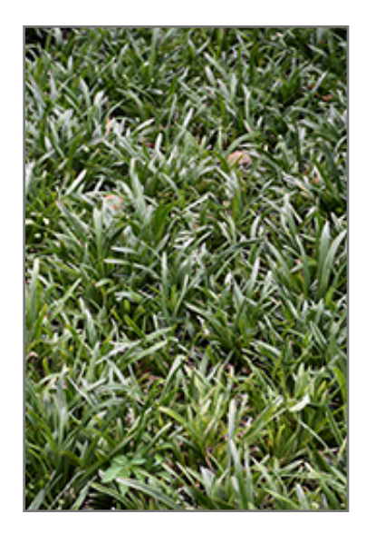
Webster Wideleaf Lily Turf