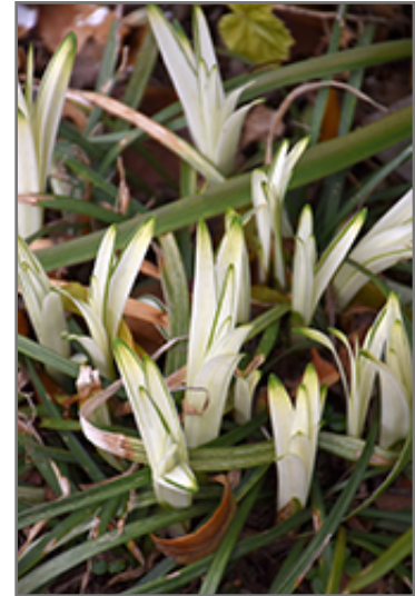
Okina Lily Turf foliage