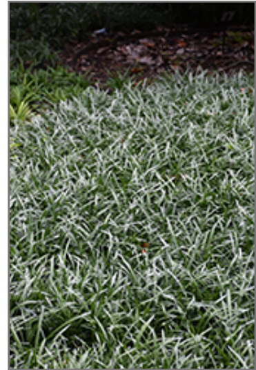
Ingwersen Lily Turf