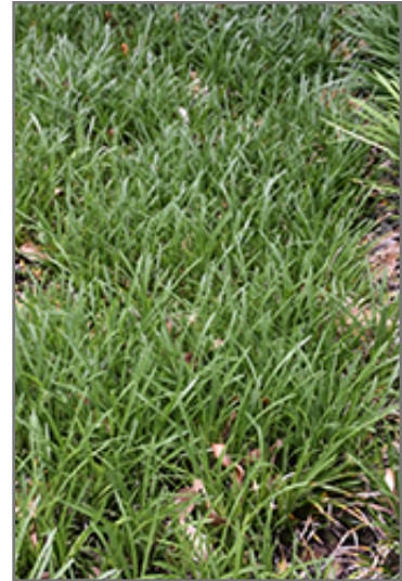
Densiflora Lily Turf