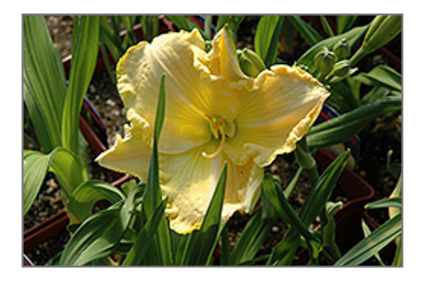
First Knight Daylily flowers