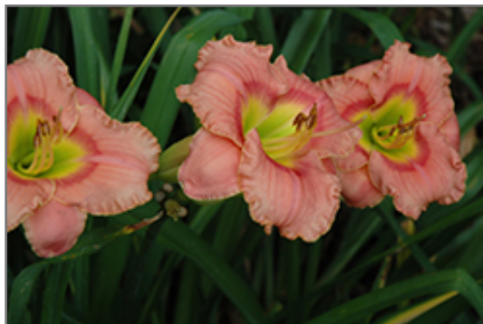
Elegant Candy Daylily flowers

Fragrant pink blooms with rosy-pink center rings and chartreuse throats flower early in the season and rebloom throughout the summer; strong sturdy stems rise above mounds of green arching foliage; low maintenance, excellent for perennial beds and borders