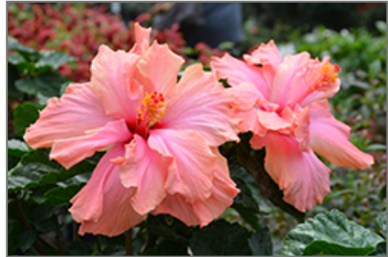
Double Johnsonii Hibiscus flowers

This plant does best in full sun to partial shade. It requires an evenly moist well-drained soil for optimal growth, but will die in standing water. To help this plant achieve its best flowering performance, periodically apply a flower-boosting fertilizer from early spring through into the active growing season. It is not particular as to soil pH, but grows best in rich soils. It is highly tolerant of urban pollution and will even thrive in inner city environments. Consider applying a thick mulch around the root zone in winter to protect it in exposed locations or colder microclimates. This is a selected variety of a species not originally from North America. It can be propagated by cuttings; however, as a cultivated variety, be aware that it may be subject to certain restrictions or prohibitions on propagation.