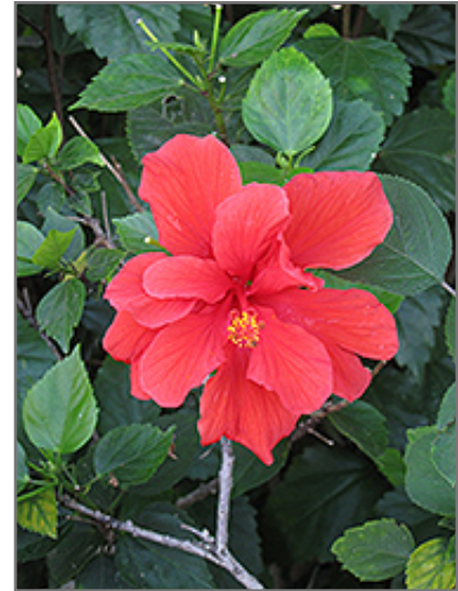
Anderson's Double Red Hibiscus flowers

This plant does best in full sun to partial shade. It requires an evenly moist well-drained soil for optimal growth, but will die in standing water. To help this plant achieve its best flowering performance, periodically apply a flower-boosting fertilizer from early spring through into the active growing season. It is not particular as to soil pH, but grows best in rich soils. It is highly tolerant of urban pollution and will even thrive in inner city environments. Consider applying a thick mulch around the root zone in winter to protect it in exposed locations or colder microclimates. This is a selected variety of a species not originally from North America. It can be propagated by cuttings; however, as a cultivated variety, be aware that it may be subject to certain restrictions or prohibitions on propagation.