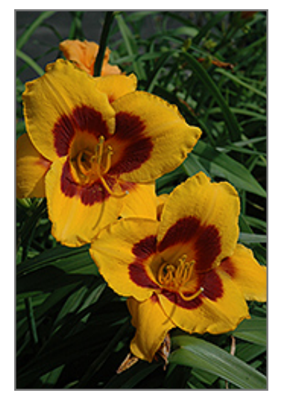
Blackberry Candy Daylily flowers

Eye-catching bright golden yellow flowers with deep, dark red eyes rise above green arching foliage; a mid season bloomer, perfect way to add color to borders, beds and containers; low maintenance, perfect for any level of gardener