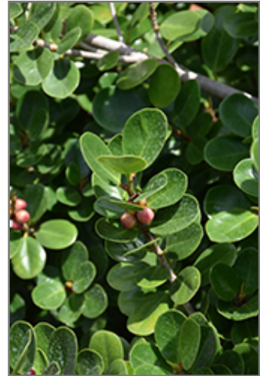
Green Island Ficus foliage

When grown indoors, Green Island Ficus can be expected to grow to be about 3 feet tall at maturity, with a spread of 3 feet. It grows at a medium rate, and under ideal conditions can be expected to live for approximately 50 years. This houseplant will do well in a location that gets either direct or indirect sunlight, although it will usually require a more brightly-lit environment than what artificial indoor lighting alone can provide. It is very adaptable to both dry and moist soil, but will not tolerate any standing water. The surface of the soil shouldn't be allowed to dry out completely, and so you should expect to water this plant once and possibly even twice each week. Be aware that your particular watering schedule may vary depending on its location in the room, the pot size, plant size and other conditions; if in doubt, ask one of our experts in the store for advice. It does not require much in the way of fertilizing once established. It is not particular as to soil type or pH; an average potting soil should work just fine.