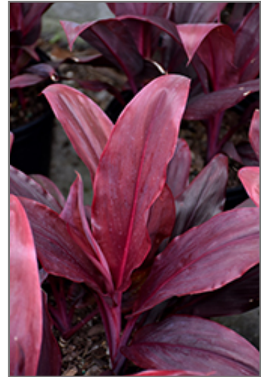
Auntie Lou Hawaiian Ti Plant foliage

When grown indoors, Auntie Lou Hawaiian Ti Plant can be expected to grow to be about 5 feet tall at maturity, with a spread of 3 feet. It grows at a medium rate, and under ideal conditions can be expected to live for approximately 10 years. This houseplant will do well in a location that gets either direct or indirect sunlight, although it will usually require a more brightly-lit environment than what artificial indoor lighting alone can provide. It does best in average to evenly moist soil, but will not tolerate standing water. The surface of the soil shouldn't be allowed to dry out completely, and so you should expect to water this plant once and possibly even twice each week. Be aware that your particular watering schedule may vary depending on its location in the room, the pot size, plant size and other conditions; if in doubt, ask one of our experts in the store for advice. It will benefit from a regular feeding with a general-purpose fertilizer with every second or third watering. It is not particular as to soil type or pH; an average potting soil should work just fine.