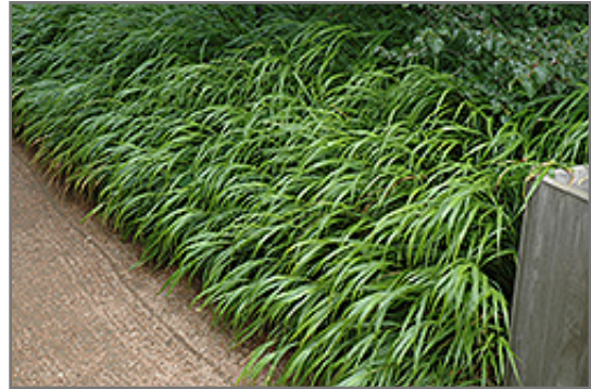
Japanese Woodland Grass