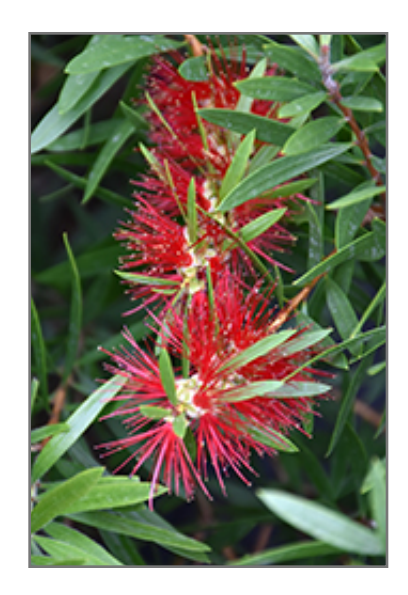
Red Cluster Bottlebrush flowers