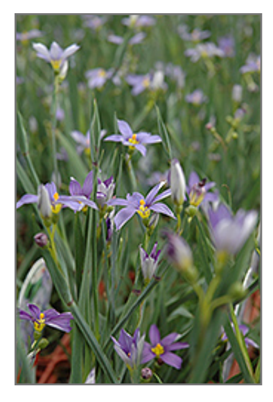
Blue Note Blue-Eyed Grass in bloom

Blue Note Blue-Eyed Grass is recommended for the following landscape applications;