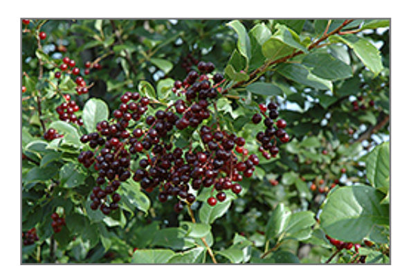
Chokecherry fruit