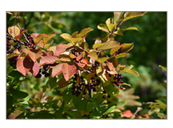
Chokecherry fruit