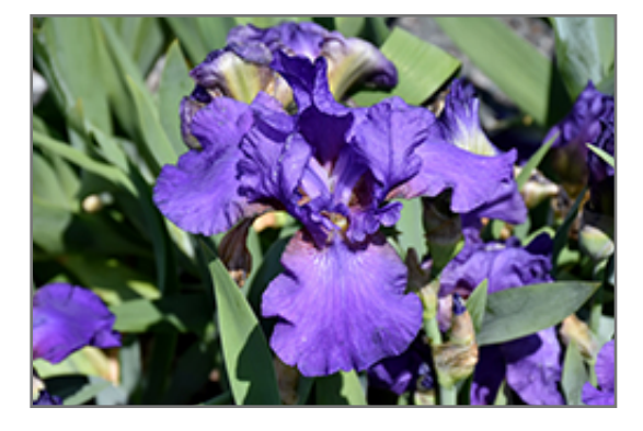
His Royal Highness Bearded Iris flowers

His Royal Highness Bearded Iris is recommended for the following landscape applications;