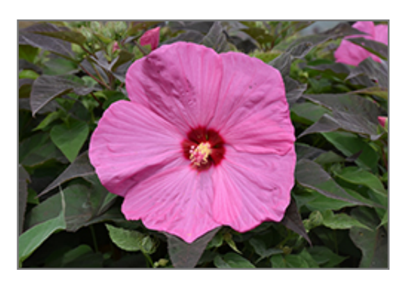
Head Over Heels Adore Hibiscus flowers

Other Names: Rose Mallow, Hardy Hibiscus