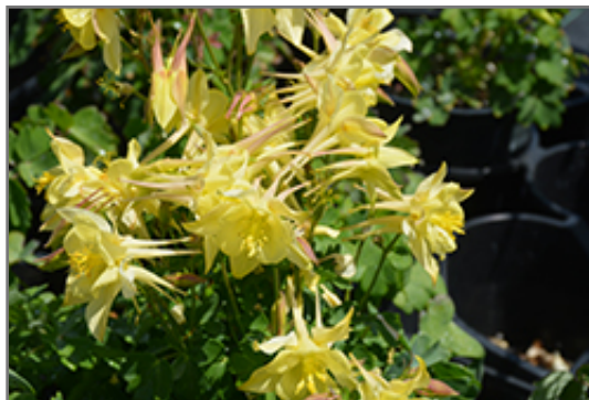
Kirigami Yellow Columbine flowers