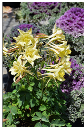
Kirigami Yellow Columbine in bloom