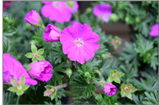
Max Frei Cranesbill flowers